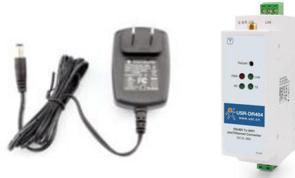
DC5V 1A power supply USR-DR404